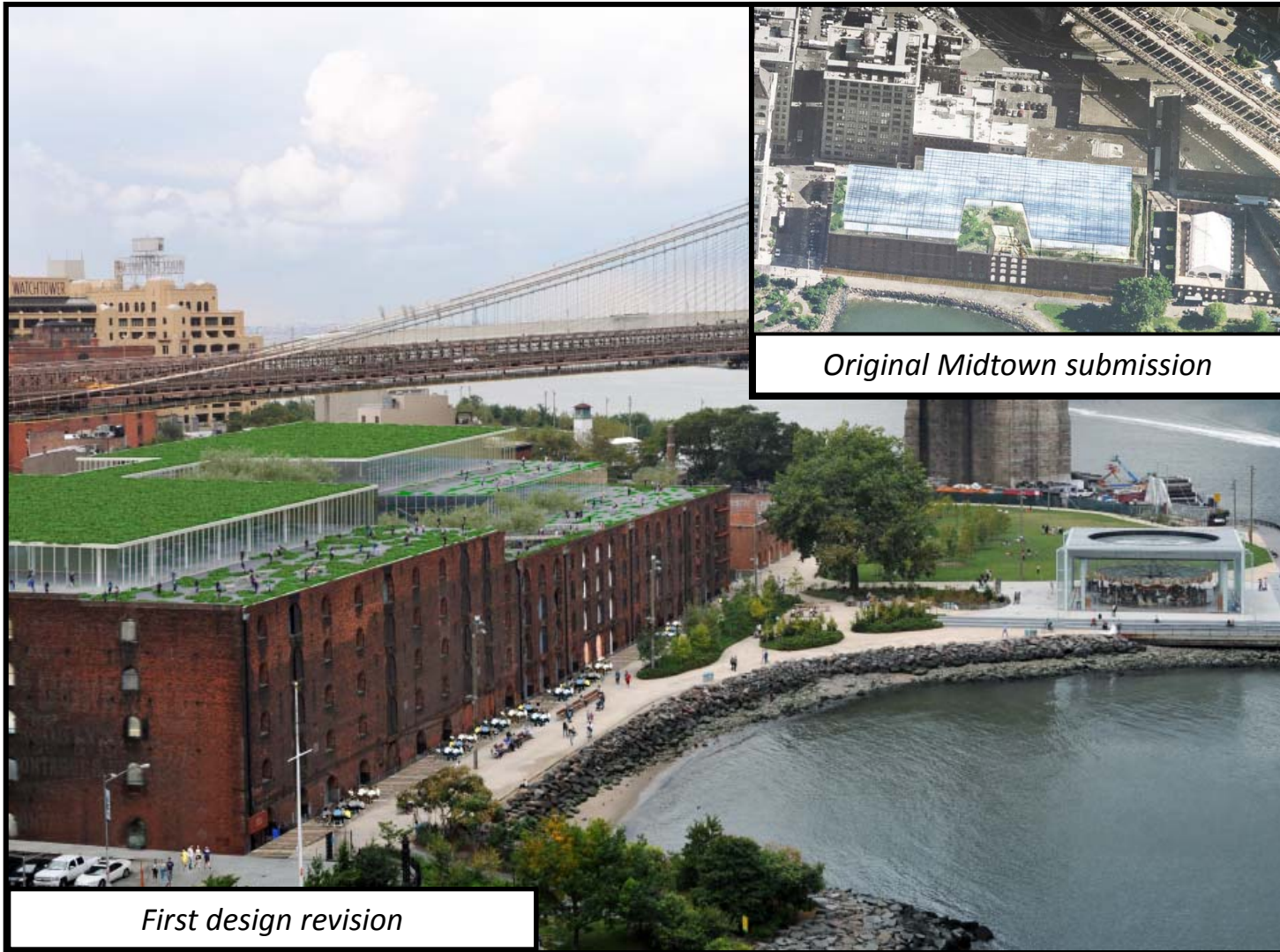
Original Midtown submission