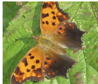
Eastern Comma Polygonia comma