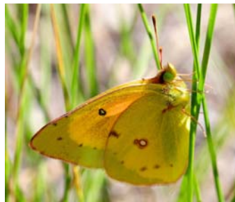
Orange Sulphur Colias eurytheme