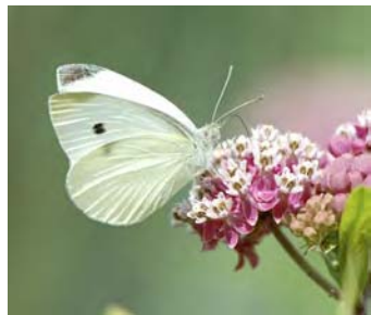
Cabbage White Pieris rapae