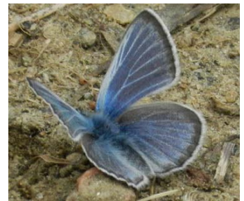
Spring Azure Celastrina ladon