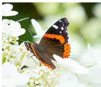
Red Admiral Vanessa atalanta