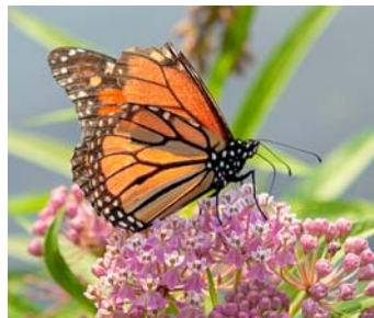
Monarch Danaus plexippus