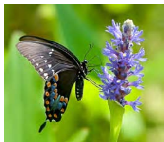
Spicebush Swallowtail Papilio troilus