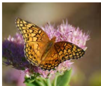
Variegated Fritillary Euptoieta claudia