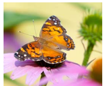
Painted Lady Vanessa cardui