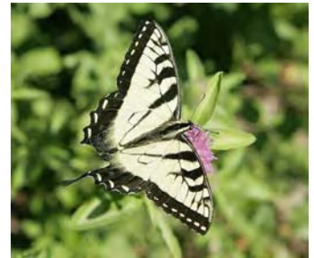
Eastern Swallowtail Papilio glaucus