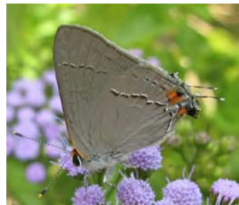
Gray Hairstreak Strymon melinus