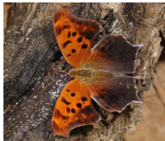
Question Mark Polygonia interrogationis