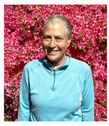
"I love everything about being a Zone volunteer — learning from the professional gardeners, being outside in one of my favorite places, making a difference in the life of the Park, and gardening in this unique and beautiful environment."

Over the course of the season, 650 Conservancy volunteers of all ages and skill sets generously donated over 3,500 hours to service projects in the Park. Stewardship opportunities included beach cleanups, horticulture projects, oyster monitoring, photography, and ongoing support at the Conservancy's movies, family festivals, and other large-scale events. While always eager to welcome new volunteers to the Park, the Conservancy was especially gratified by the support of returning volunteers (both individuals and groups), many of whom joined during the pandemic.